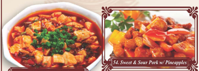
508. Mah Po Tofu