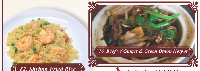
82. Shrimp Fried Rice