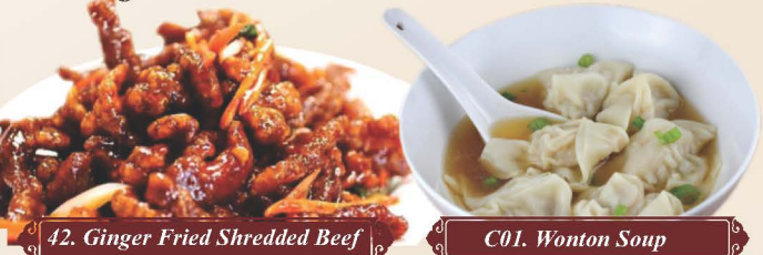
42. Ginger Fried Shredded Beef